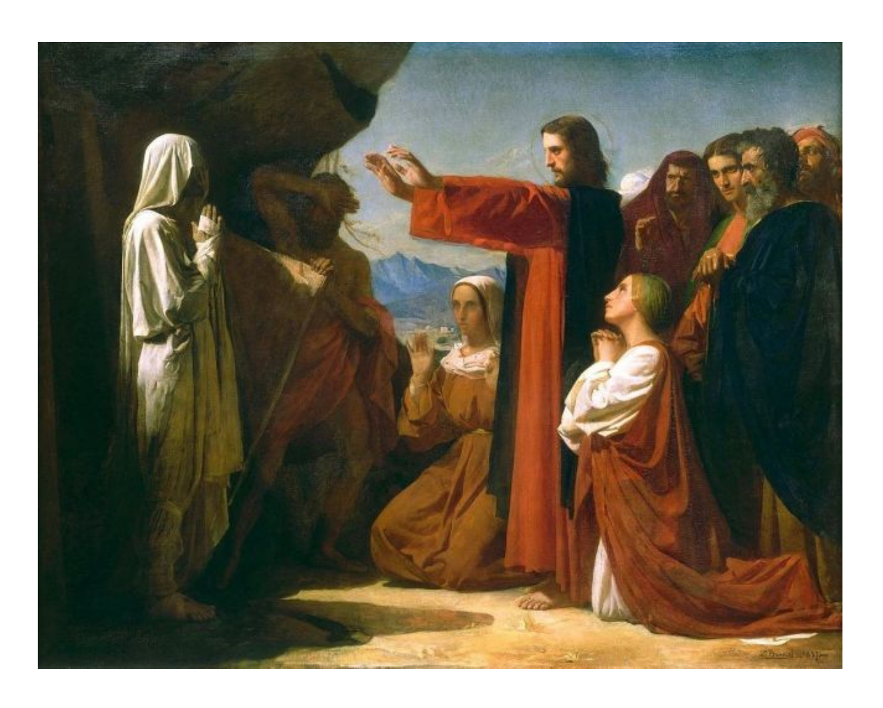
The Raising of Lazarus

Have you ever noticed some of the similarities between the raising of Lazarus and the raising of Jesus? One of my students recently pointed out a few of them and wondered why that may be, so let's take a look at some of those and think through what their significance is for the Christian faith.